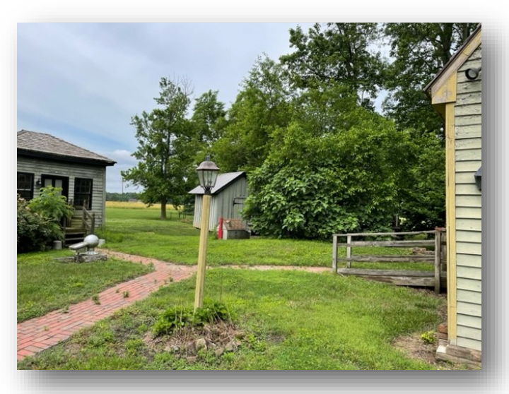
Rural Life Museum (Backyard) 29379 Backtown Rd, Trappe

Can you give us the name of one (1) of the three outdoor buildings?