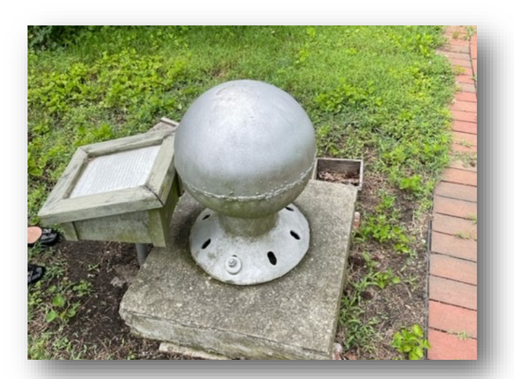
Rural Life Museum (Backyard) 29379 Backtown Rd, Trappe What purpose did this big silver ball serve?

In what Talbot County town did Robert Morris live after coming to America?