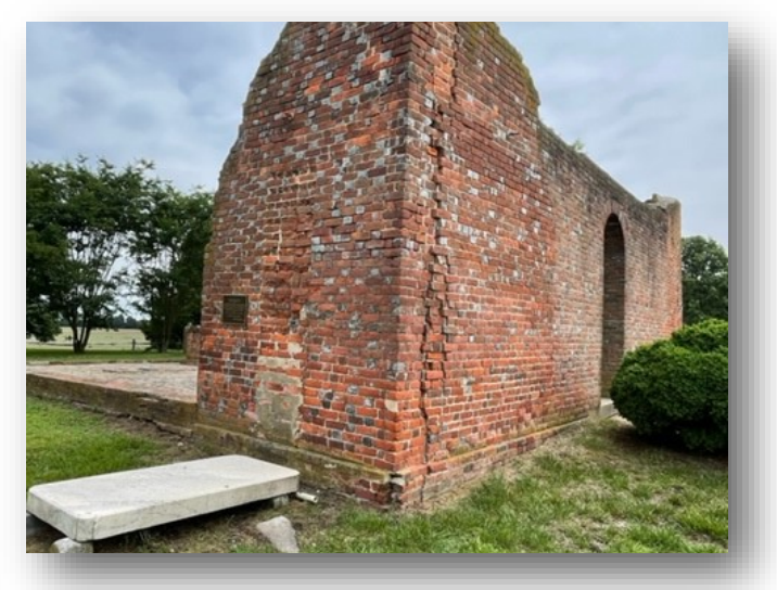
White Marsh Church Rt. 50 and Manadier Road

What year did the Hole In the Wall Village and Inn exist in this location?