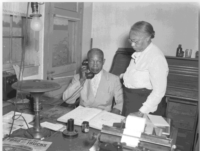
Mary Jenkins House 30 S. Washington Street

What year was this document issued and to whom?