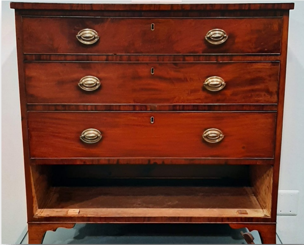
Exhibit: Made In Talbot County 25 S. Washington Street

Whose signature can be seen at the bottom of this chest of drawers?