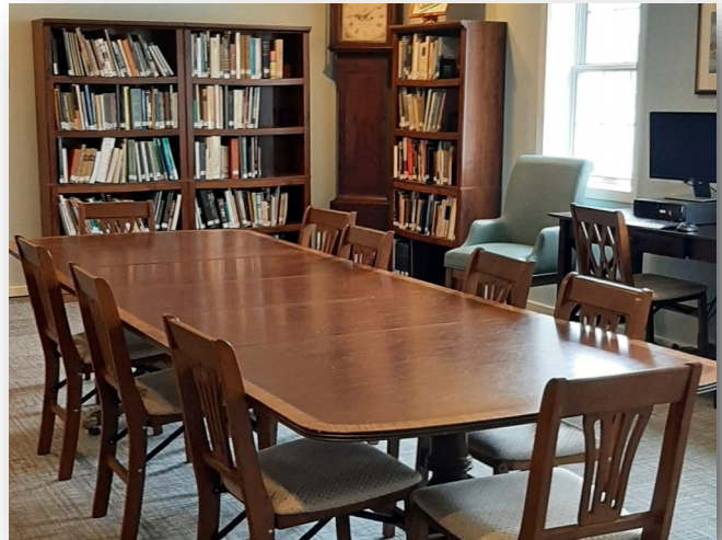
Exhibit: Made In Talbot County 25 S. Washington Street

Whose signature can be seen at the bottom of this chest of drawers?